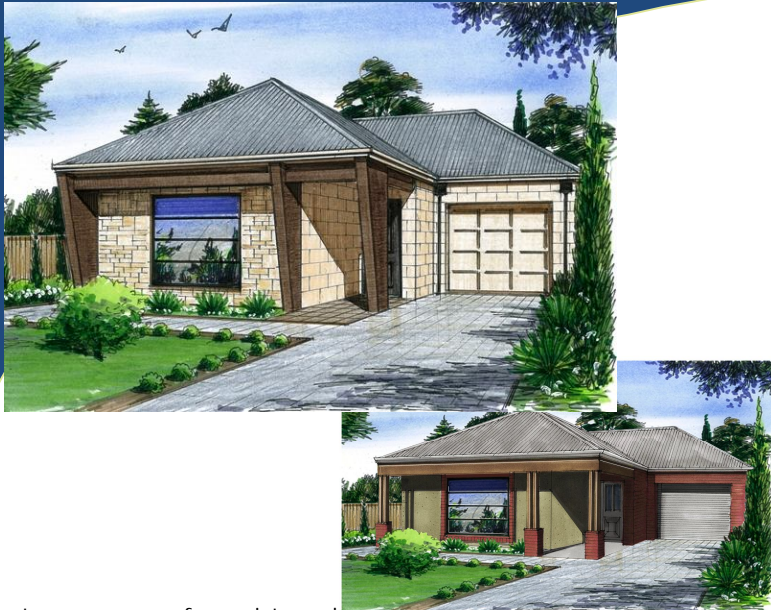
Frontage may vary from picture shown